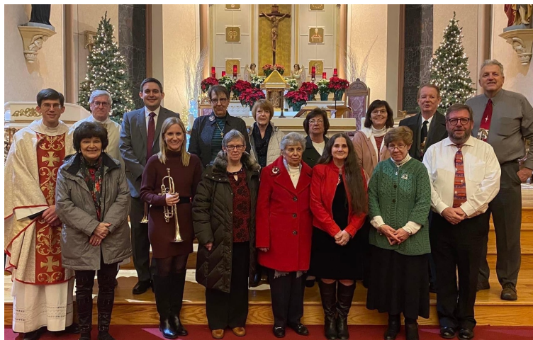
St. John's Christmas Choir