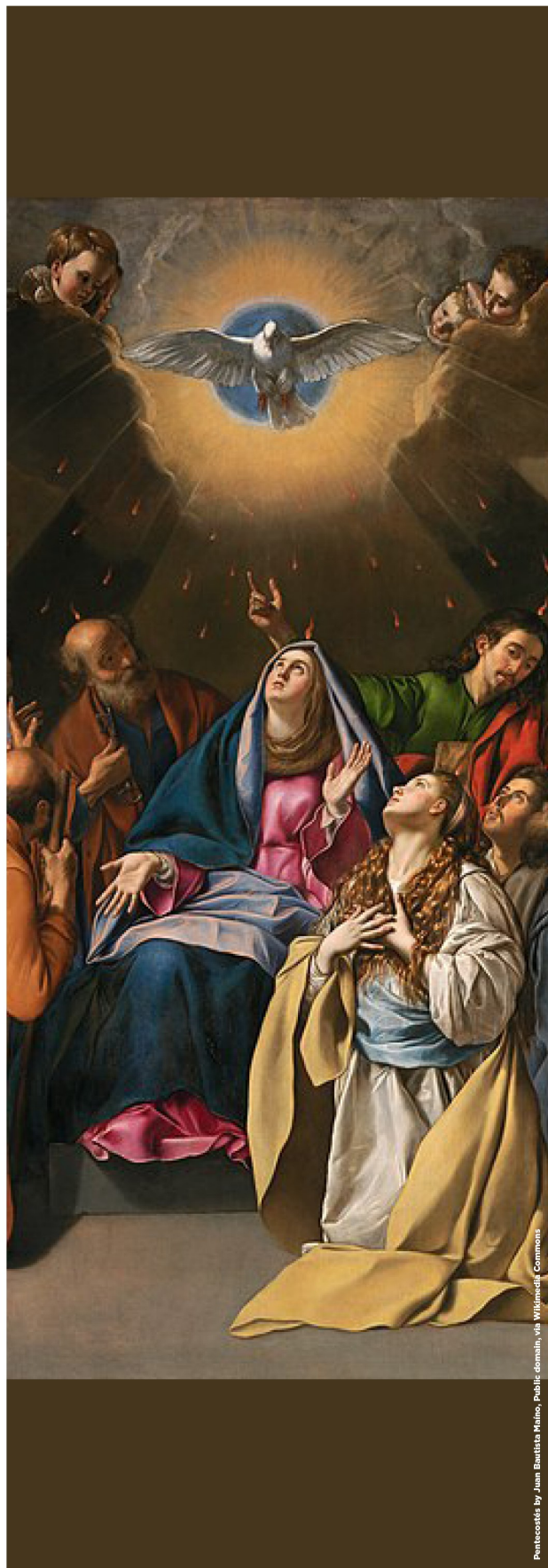
Pentecosts by Juan Bautista Maíno

PRAY We thank you, God, for the ways your Holy Spirit helps us see your love through the people and world around us. We thank you for the gifts of the Spirit within us and for the gift of your Son, Jesus Christ. Holy Spirit, open our hearts as we listen to your word. We ask this in Christ’s name.